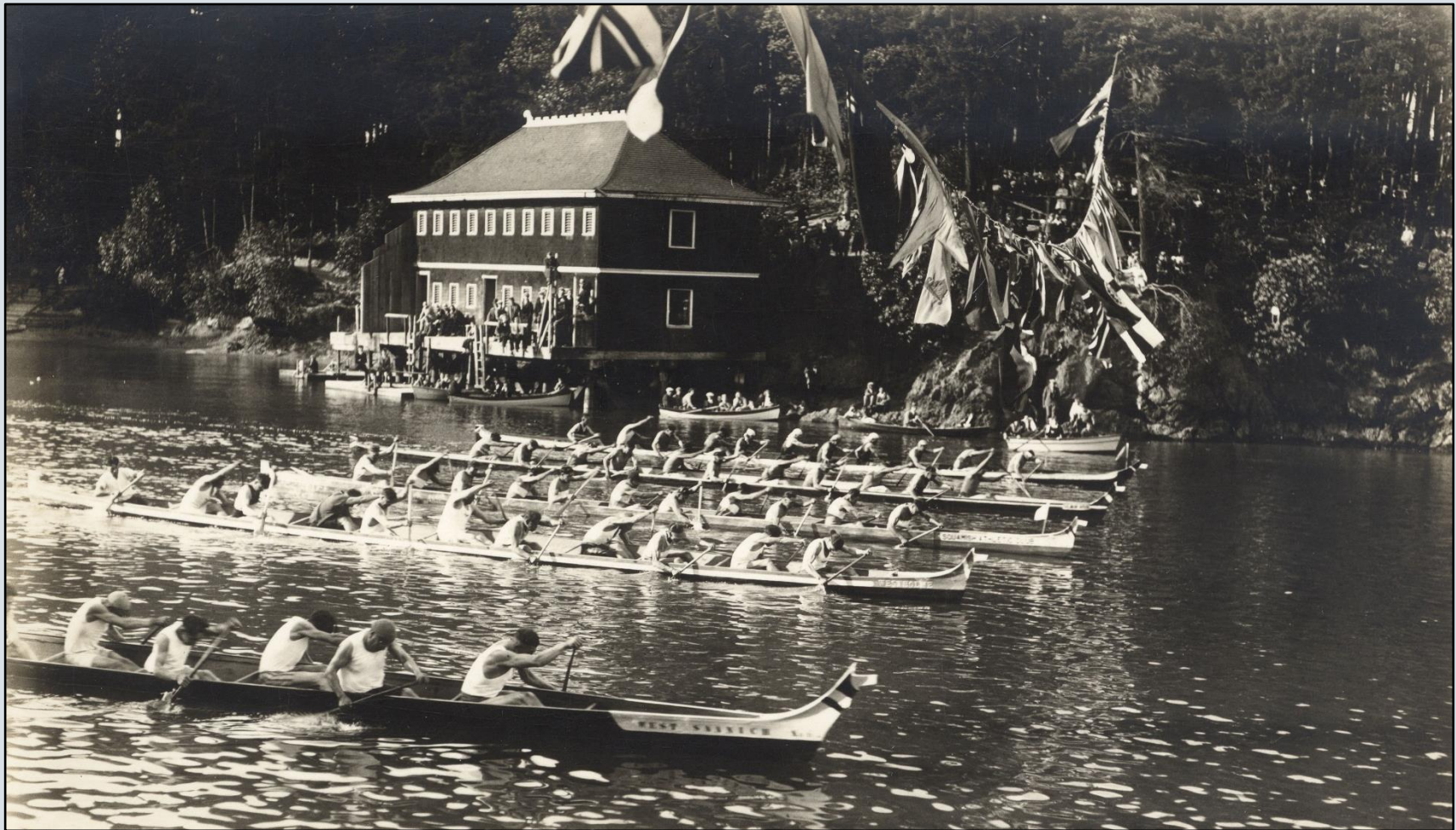
First Nations canoe race on the Gorge, 24 May 1932 (2015-017-065)

Most competitors came from reserves in the Victoria area including Sooke, Saanich Peninsula, and the Cowichan Valley. Visiting First Nations crews camped along the shore of the old Songhees Reserve in what is now Vic West, and spent part of their time attending potlatches and sunrise ceremonies.