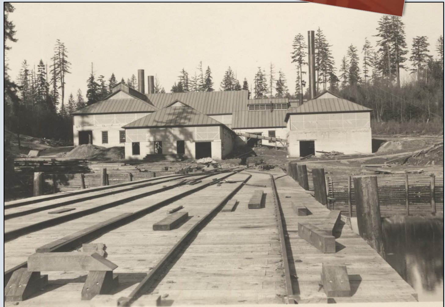
Butchart Cement Plant, 1904 (1981-019-019)