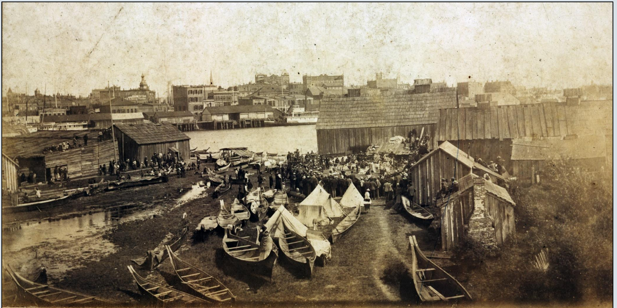
Songhees First Nations Potlatch on the site of the former reserve, west side of the Johnson Street Bridge, 1895 (1989-008-194)

Evidence of First Nations settlement in the area now called Saanich dates back over 4,000 years. The District of Saanich lies within the traditional territories of the Lək̓ʷəŋən peoples known today as Songhees and Esquimalt Nations, and the W̱SÁNEĆ peoples known today as W̱JOLEŁP (Tsartlip), BOKÉĆEN (Pauquachin), S̱ÁUTW̱ (Tsawout), W̱SIKEM (Tseycum) and MÁLEXEŁ (Malahat) Nations. Each group formed a distinct nation within their own territory and their historical connections with the land continue to this day.