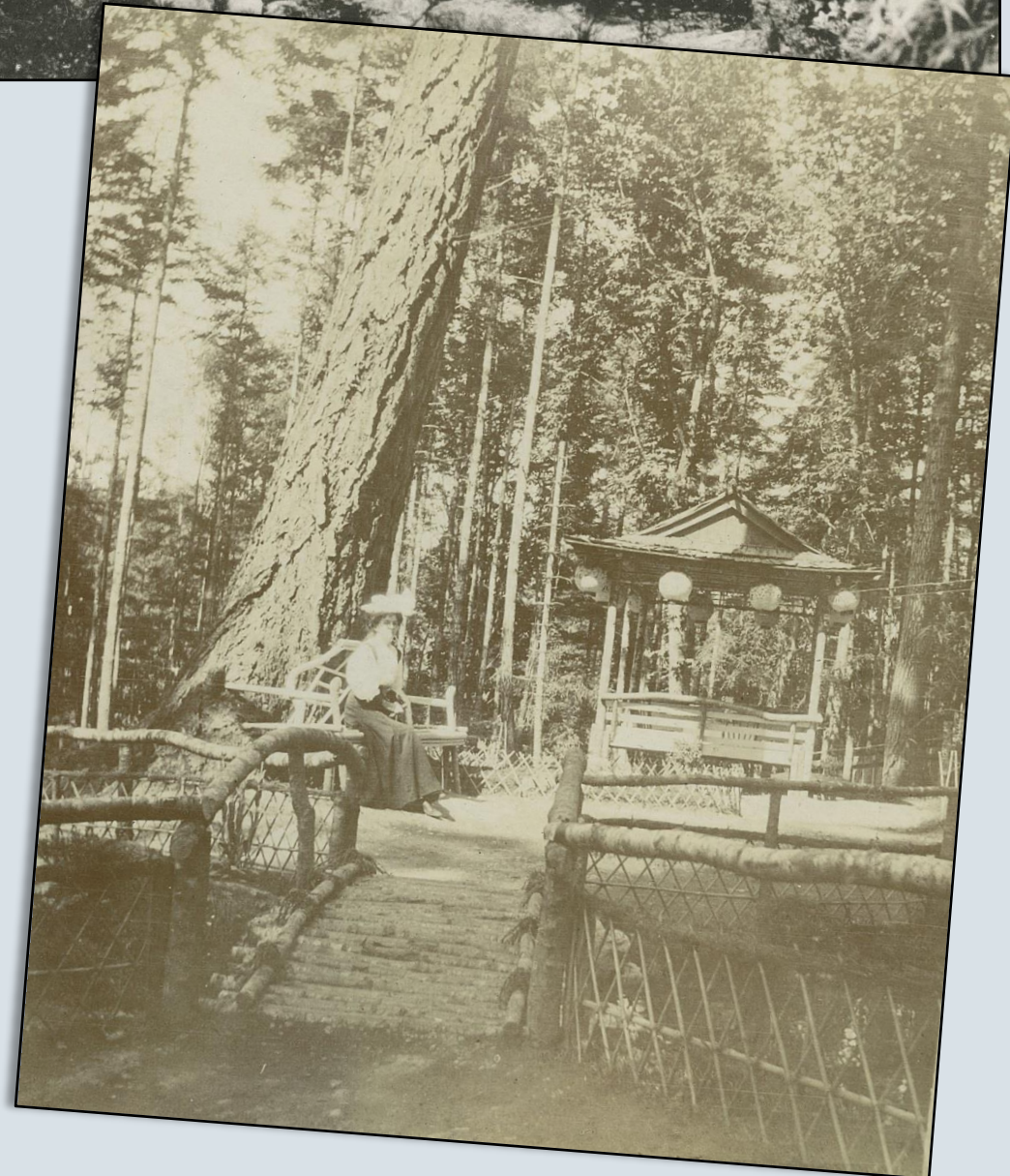
Japanese Tea Garden, ca. 1910s (2018-030-235 and 2007-046-076)