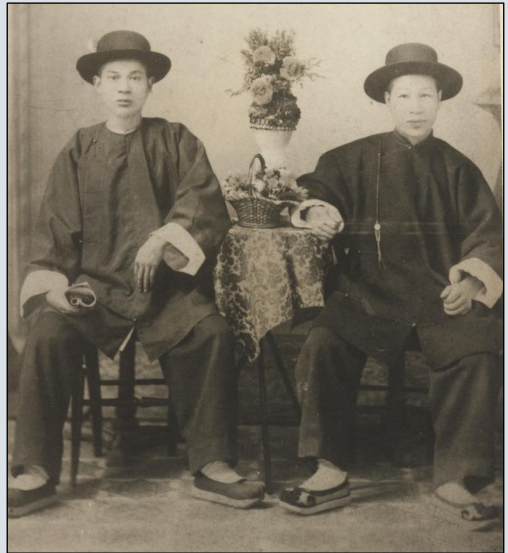
Portrait of unidentified Chinese cook and foreman of Broadmead Farm, taken on Chinese New Year, 1893 (1980-020-002)

In 1872, the BC Legislature passed the first law to disqualify Chinese from voting in provincial elections. In 1895, new legislation made qualifying to vote in the federal election dependant on the provincial voters’ list. Having been stripped of their provincial voting rights, this meant that Chinese Canadians lost the federal vote too. They did not win back their right to vote until 1947 when the federal Chinese Immigration Act , also known as the Chinese Exclusion Act , was repealed.