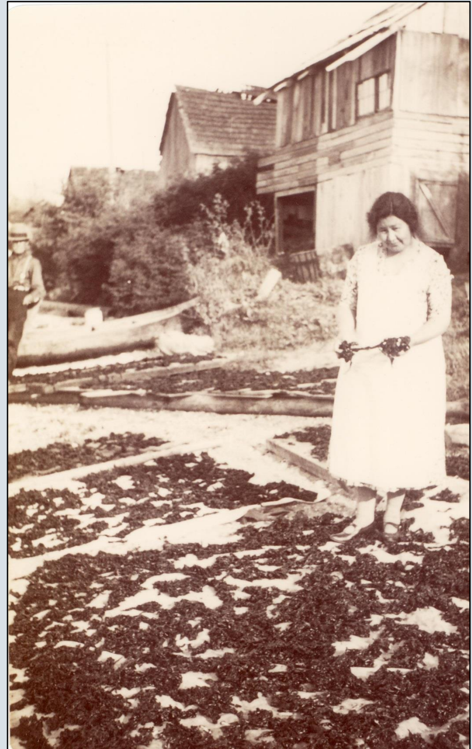
Unidentified First Nations woman drying seaweed, 1904 (1981-019-099)