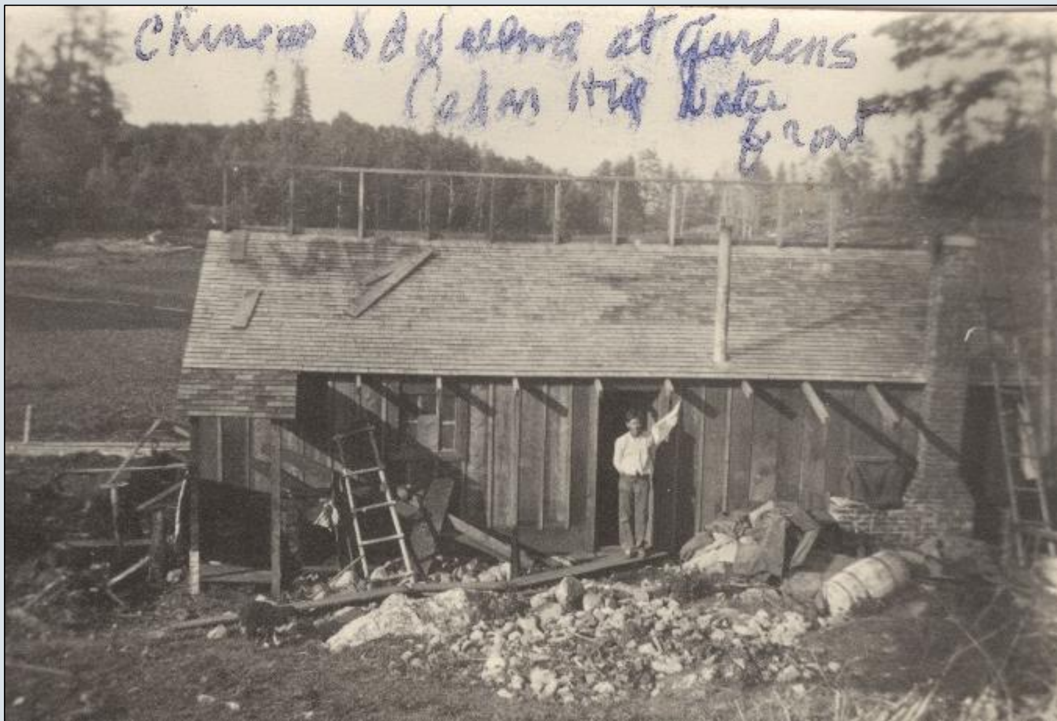
Chinese dwelling on McMorran Farm, ca. early 1900s (1989-008-084)