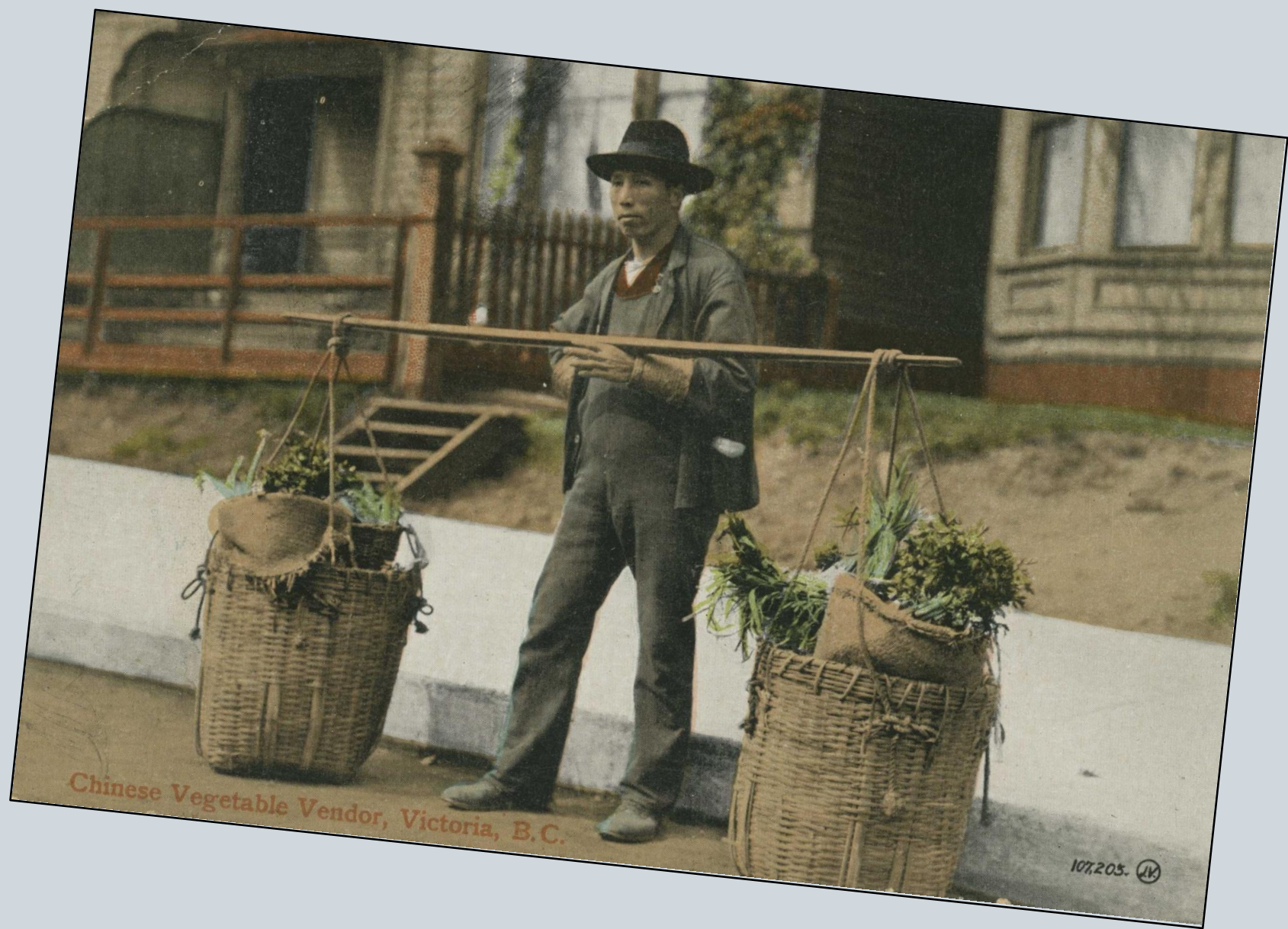
Chinese vegetable vendor, 1911 (2018-030-107)

In order to improve the diversity of our archival collection and our ability to tell diverse stories, Saanich Archives encourages donations of historical material from members of underrepresented communities.