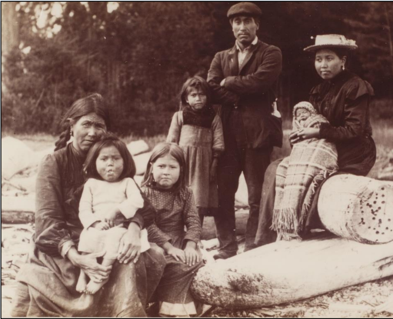
Unidentified First Nations family in Sidney, 1900 (1981-019-100)