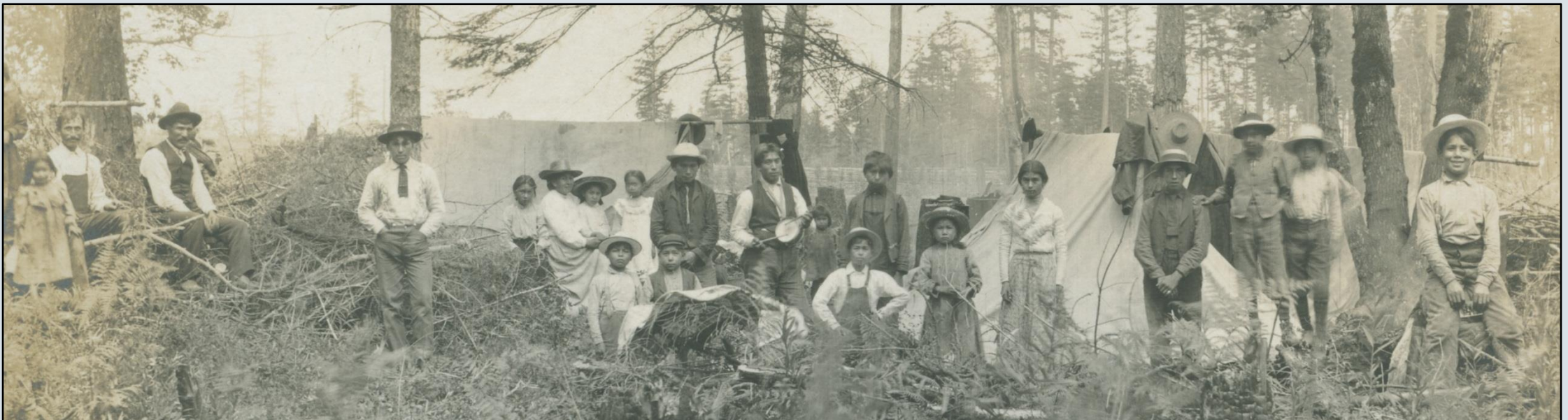
Top: Unidentified First Nations strawberry pickers on the Vantreight Farm in Gordon Head, 1906 (1984-012-001b)