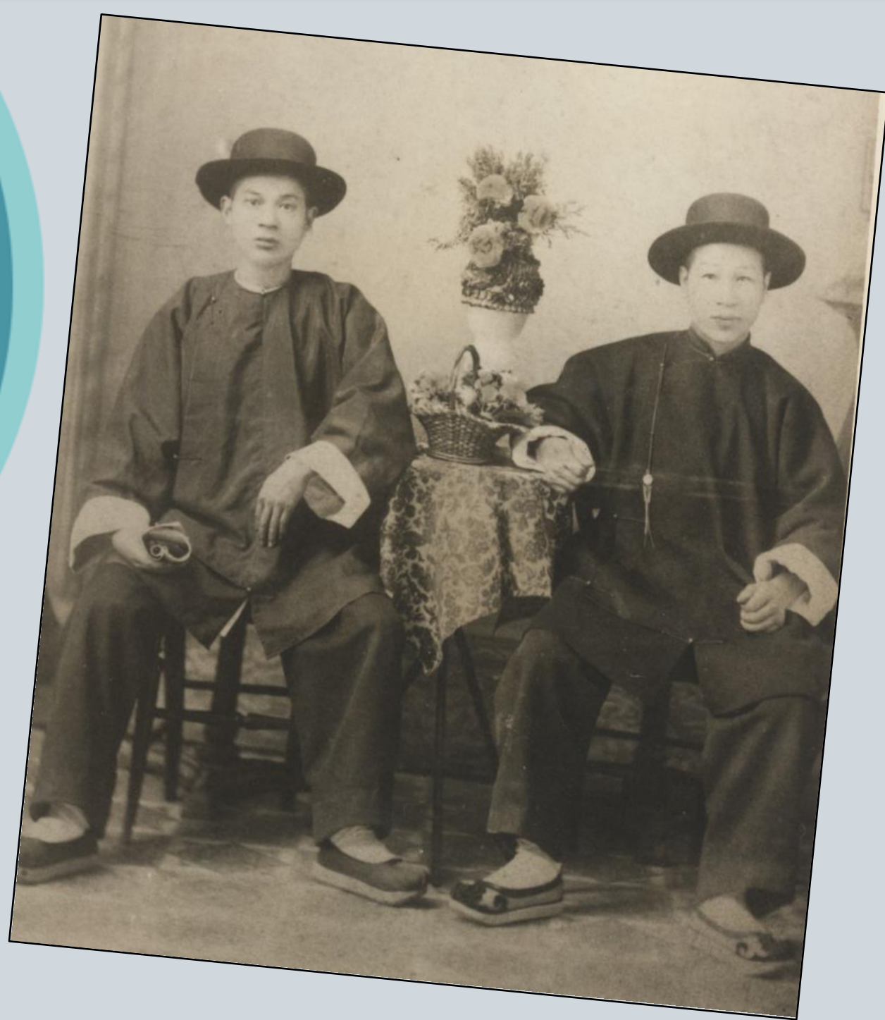
Portrait of unidentified Chinese cook and foreman of Broadmead Farm, taken on Chinese New Year, 1893 (1980-020-002)

Diversity has existed on the Saanich Peninsula since long before the first Europeans arrived and for nearly 200 years, immigrants from across the world have chosen to make this area their home.