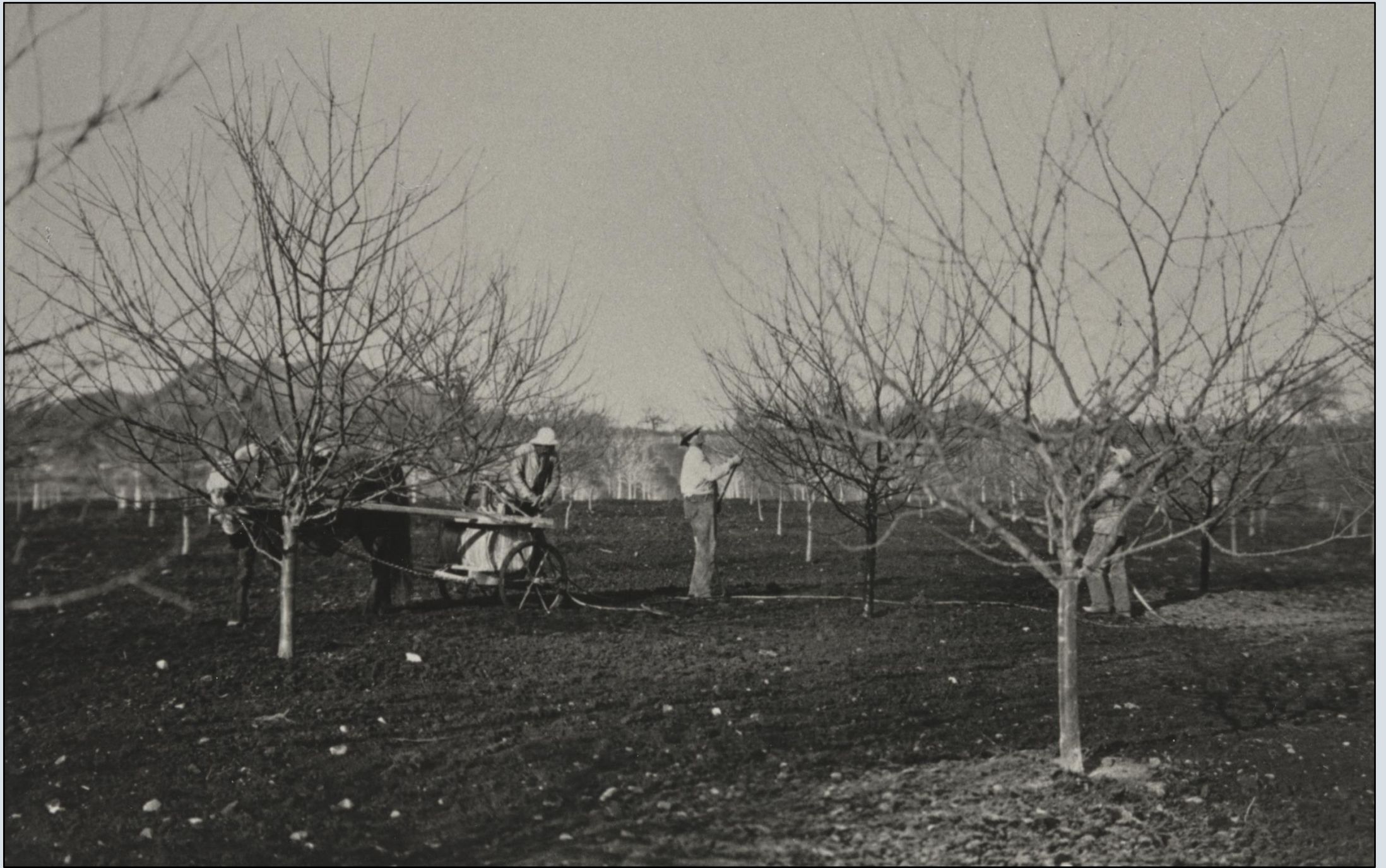
Unidentified Chinese labourers working the spray rig on the Borden Orchard, ca. 1910s (1980-008-009)